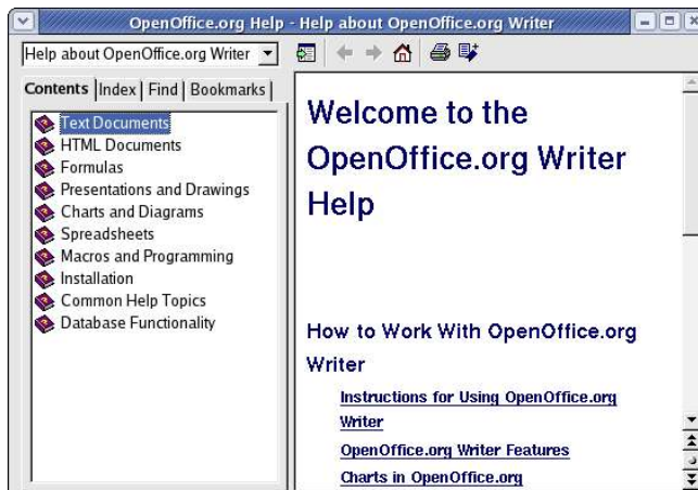
Fig. OpenOffice.org Writer Help Screen

Most of the Desktop applications have a Help button in their main menubar at the top. Selecting this will give you more information on how to use the application. The Help screen for the OpenOffice.org Writer application is displayed below.