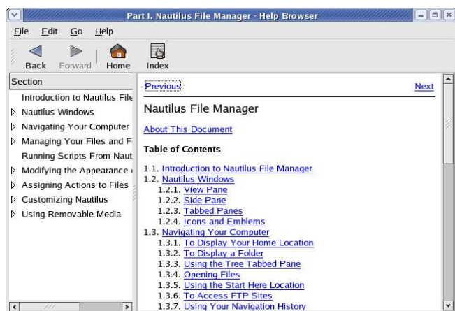
Fig. File Manager Help Screen